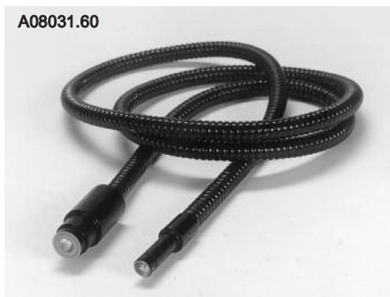
Single Bundle, A08031.60